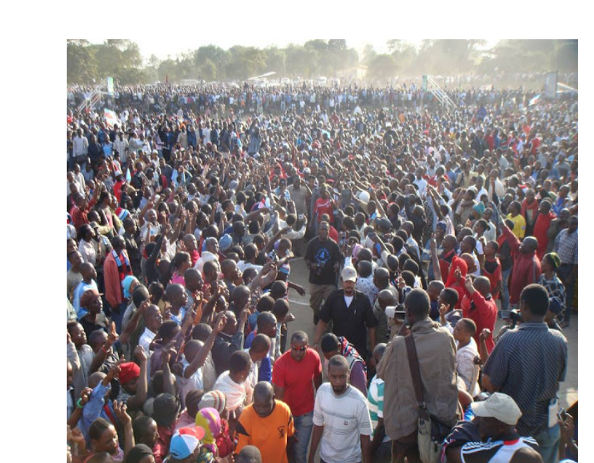
The bombed rally in Arusha Soweto. The rally was conducted by CHADEMA