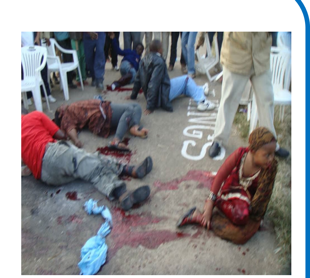
Injured people after soweto explosion in Arusha

On the other hand some political parties and other government leaders throw a ball to each other. That is CHAMA CHA MAPINDUZI against CHADEMA and vice versa is true. Some reporters and other citizens said that during the Chadema political campaigns they bombed themselves on 15<sup>th</sup> June 2014, in order to change citizen's mind to rulling party. Others said that acid (tindikali) splashing and explosions in Zanzibar are done by Chama cha mapinduzi.